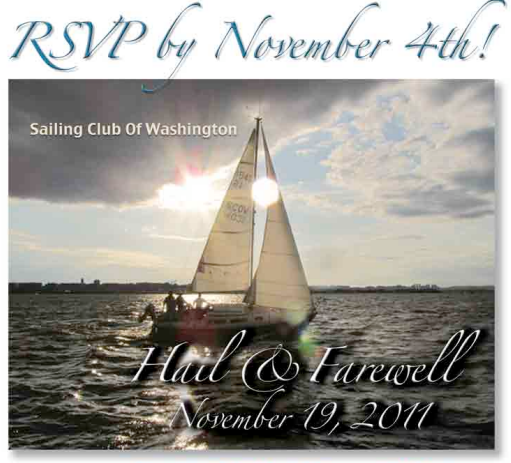
November 19, 2011 from 6:00 pm until 11:00 pm Capital Yacht Club • 1000 Water Street, SW, Washington, DC