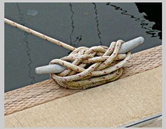
Is This Your Cleat?

We certainly did our best to win the afterparty that took place shortly thereafter. What a great regatta! Thanks for being wonderful supporters!