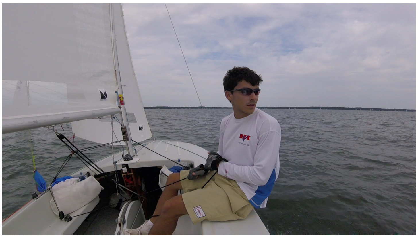
Off on starboard tack after the start – Can we tack yet?