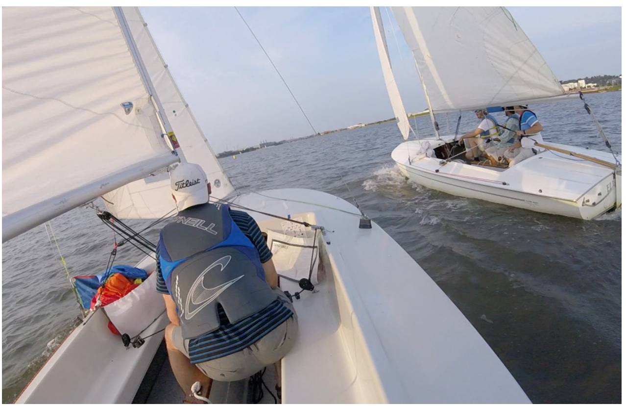
The sprint to the mark. On this short course, whoever rounds the windward mark first will win the race. Triple B barely fetching, has to pinch. Elisse has the speed edge.