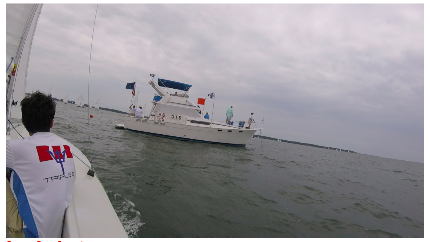
Day 2 – Race Committee