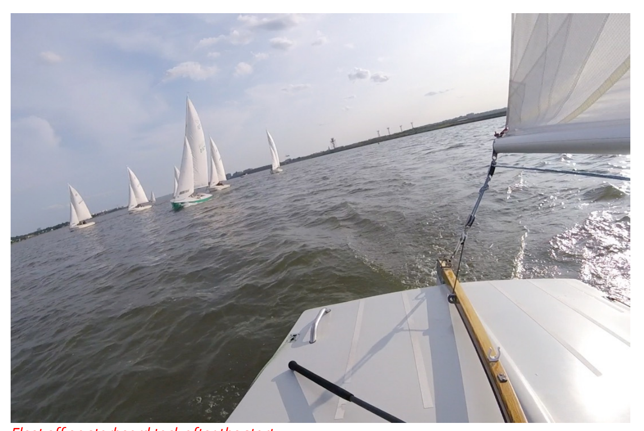
Fleet off on starboard tack after the start