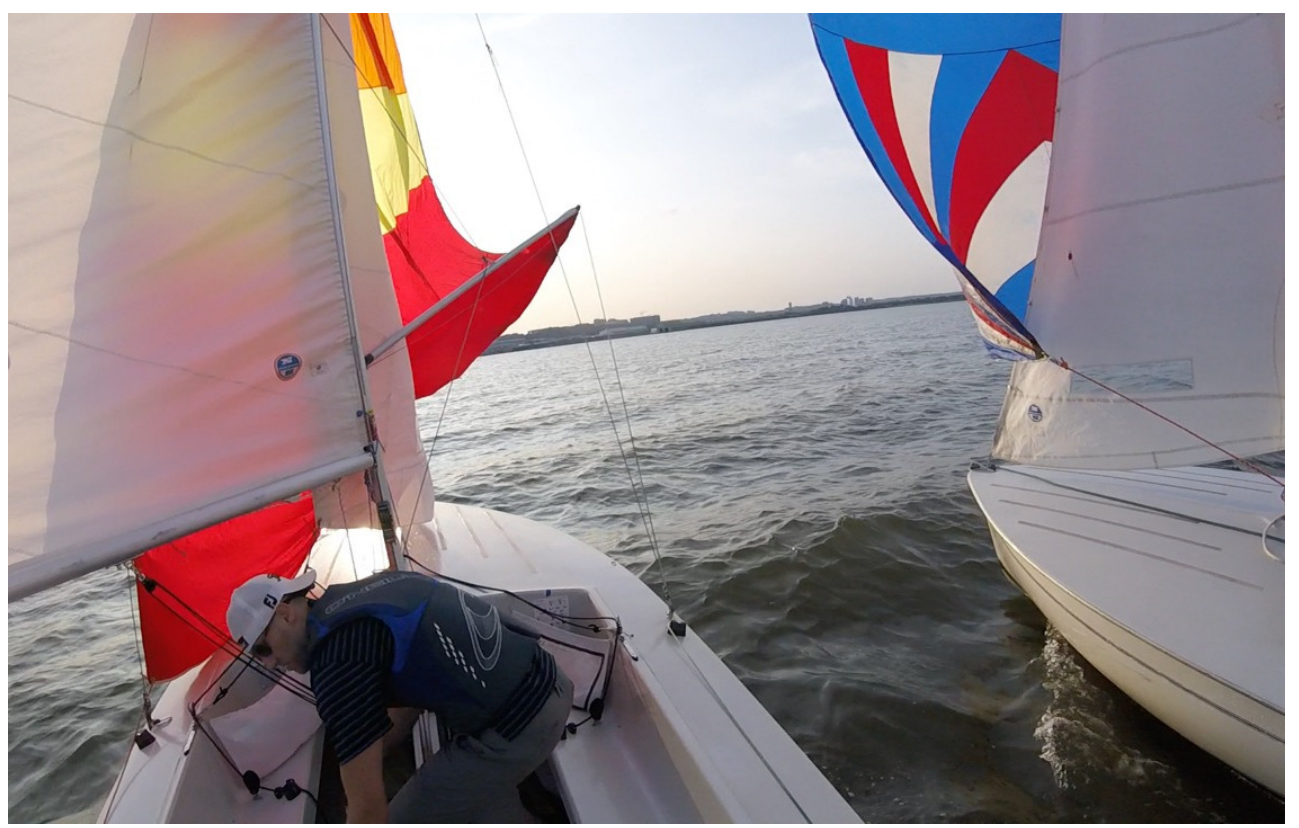
Sunset Song and Triple B cozy alongside during spinnaker hoist