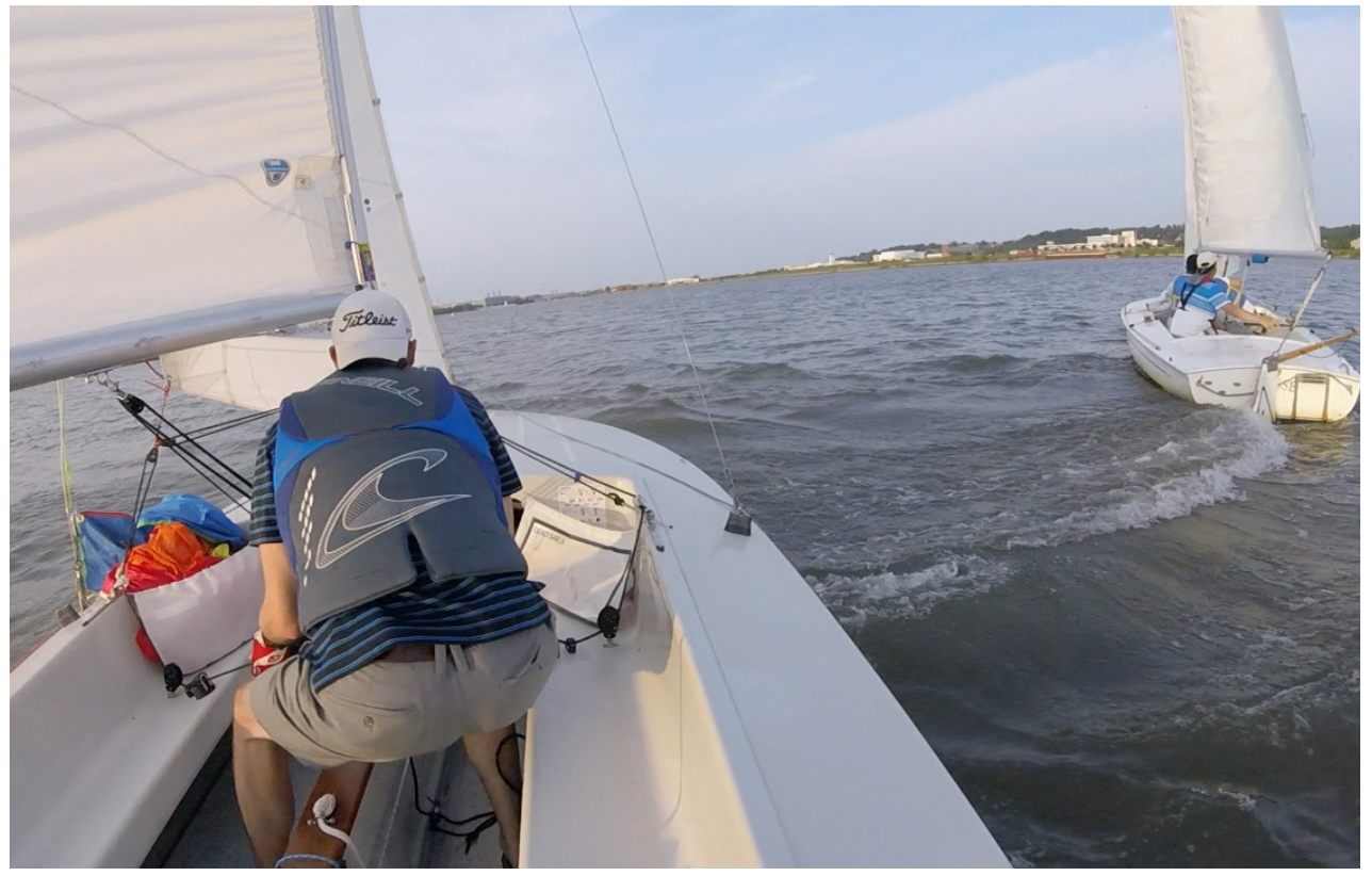
Triple B tacking behind Elisse after reeling her in on the final beat of the last race of the day. Elisse tacks to cover and stay ahead at the starboard tack layline.