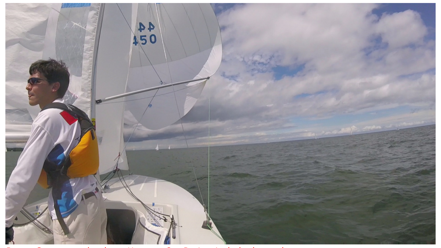
Day 1 – Sun starts to break out. Hampton One Designs in the background.