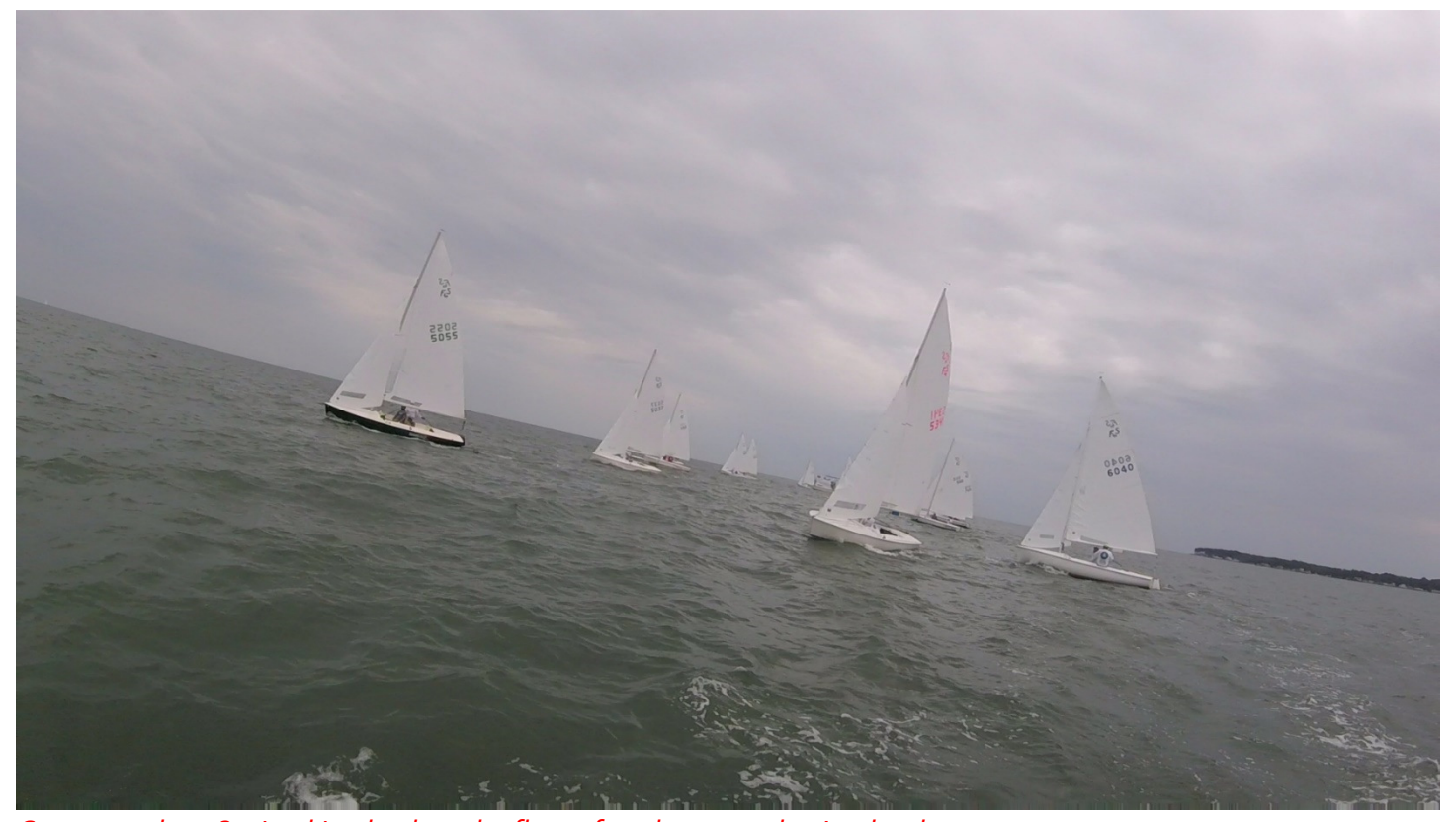
Can we tack yet? – Looking back at the fleet after the start, that's what he sees.