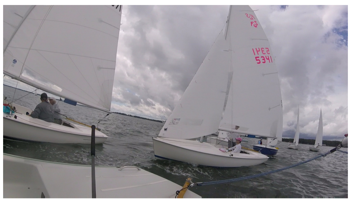
Day 1 Race 2 – Getting off to a good start with most of the fleet astern.