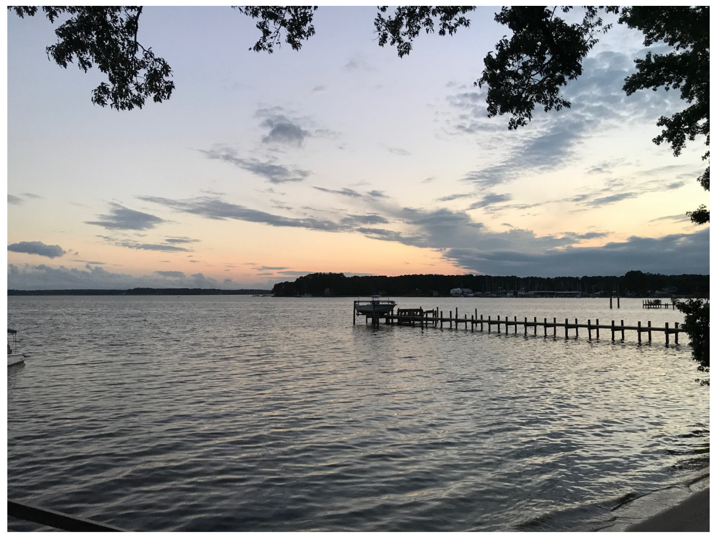
Fishing Bay at sunset.