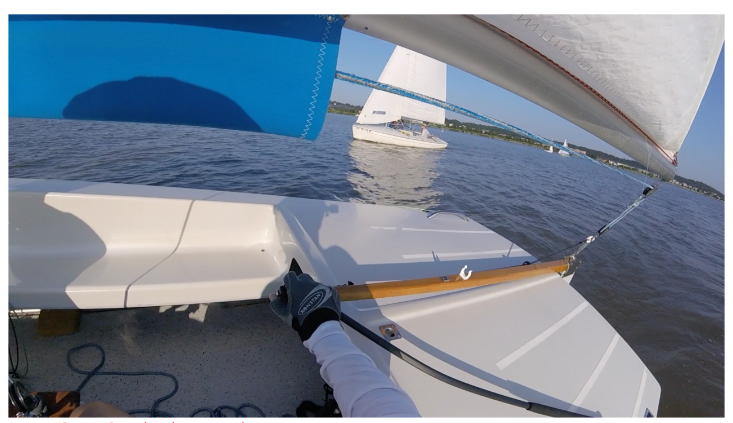
Day 1 – Sunset Song heading upwind

Day 2 – PRO Ronnie Lewis, not only did a great job running the races, he brought a sweet deck boat out for the Race Committee. Sunday, 21 Aug is why we sail. 78 degree air temp, low humidity, and 8-10 kt wind. The northeast wind dictated an east-west orientation for course set up which means short sprint races that are more tactical than longer courses. Races were close with a lot of company at the marks.