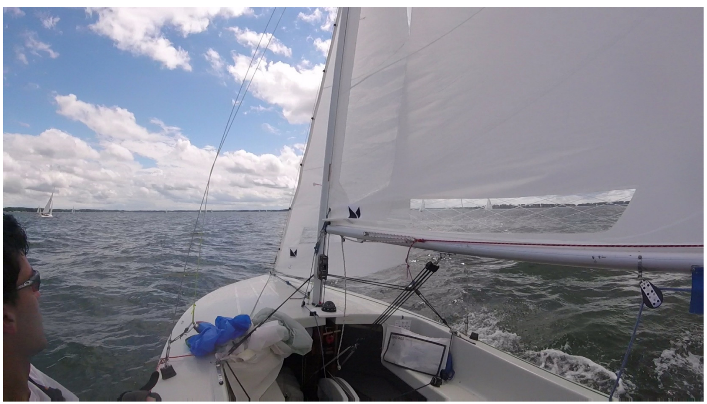
Day 1 – Blue sky. Tacking in light wind and heavy chop costs a lot of distance and speed.