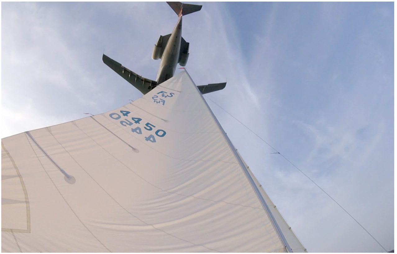
'Scuse me while I kiss the sky. Warning: objects in the GoPro are much closer in real life than they appear in photos. Flight attendant told us to finish our drinks.