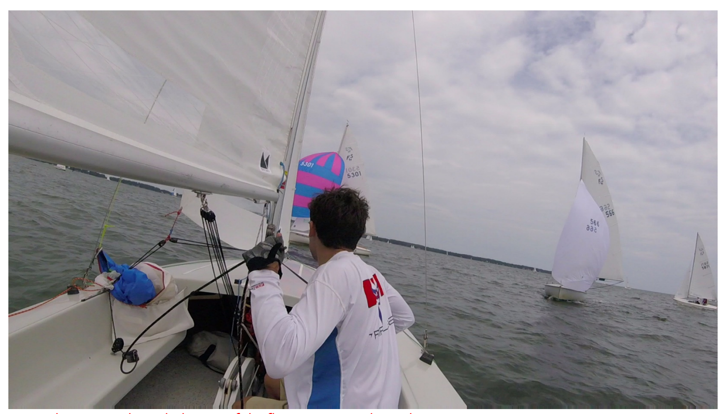
Upwind, weaving through the rest of the fleet on its way down the course.