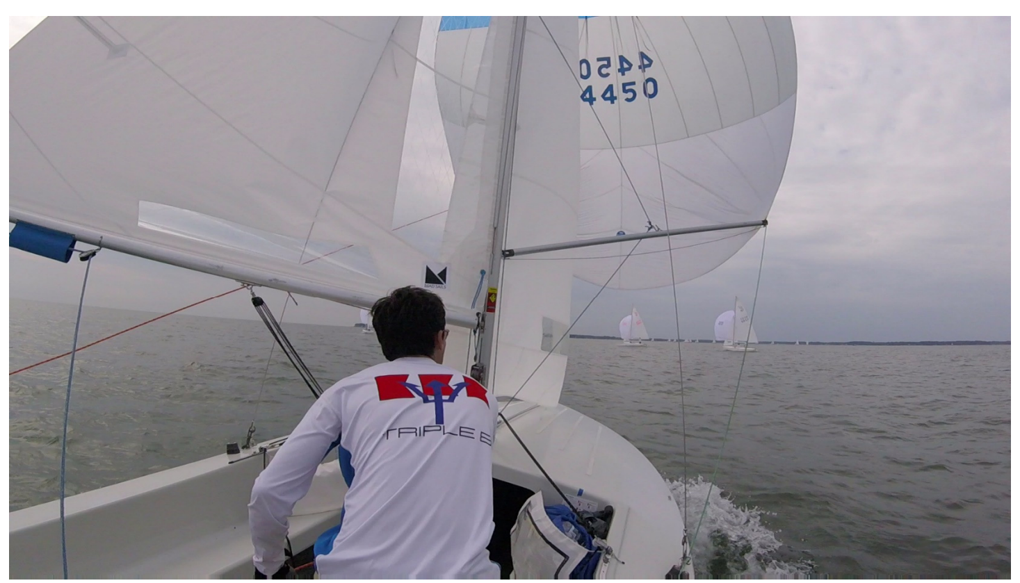
The leaders, almost within reach.