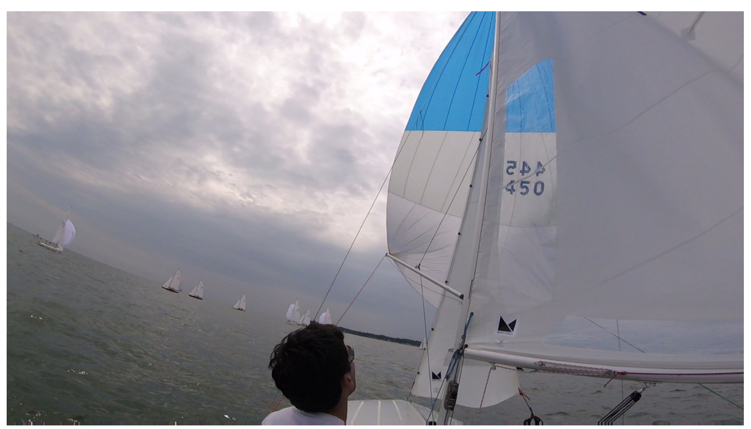
Hampton One Designs heading back up the course as Flying Scot leaders approach leeward mark. Boat at far left, another father-son team, meets us at the mark.