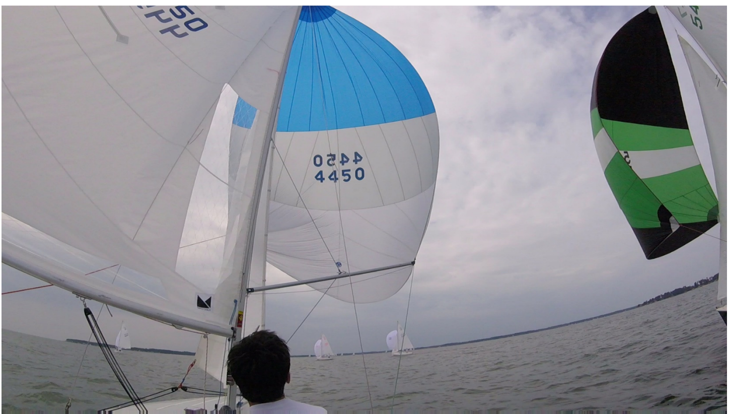
In 4<sup>th</sup> place on the run once we got past the guy alongside.