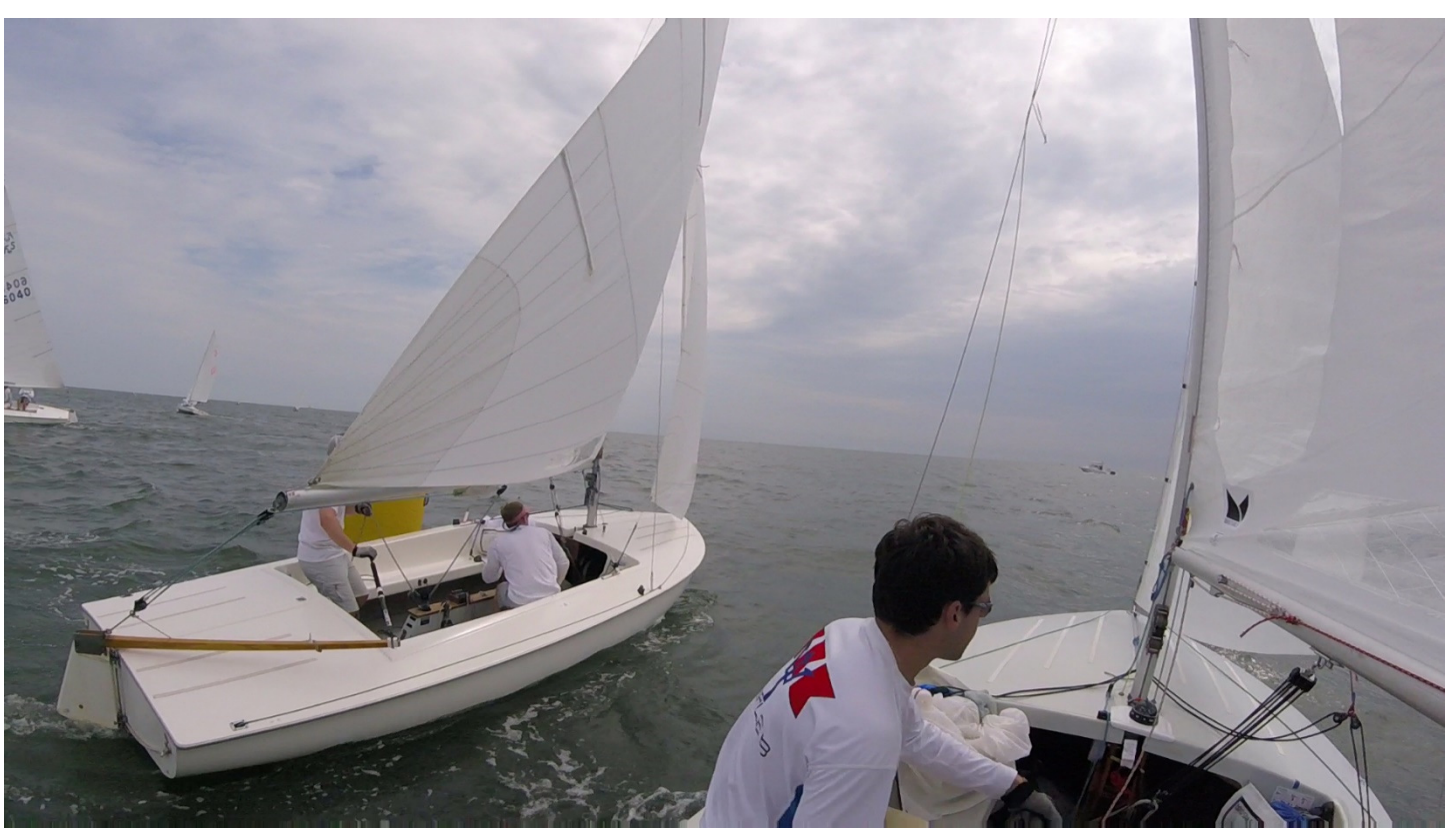
They round inside and the race for third place is on. They eventually prevailed and finished second overall for the regatta.