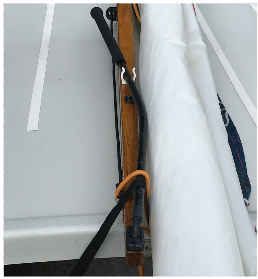
Need to replace that. Not sure how it happened but it happened fast.

On Sunday, we got out of the blocks with a great start and led for the first mile and ended up finishing 7<sup>th</sup>. We figured out how to get the lead. Now we need to figure out how to keep it. We probably needed to tack more this time so we didn't have so much lateral distance between us and the rest of the fleet. Too much leverage. We had a great start going in the second race but determined that we might not have stayed clear enough of a leeward boat at the starting line, so we took a penalty turn even though there was no protest. We weren't sure, but better to try and be a good ambassador, than push things for the sake of a few boat places. Despite the penalty, we came back to finish 7<sup>th</sup>. In the last race we decided to start at the committee boat end of the line so we could go right and take advantage of a right shift that was on. We tacked out to the right after the start, had a strong race, and edged out another boat in a spinnaker drag race to the finish line to take 4<sup>th</sup>. After it was all said and done, we ended up 5<sup>th</sup> out of 20 for the weekend and were really happy with it. Regatta results here. <a href="https://www.fbyc.net/Events/2017/08.12.onedesign/FS-HOD.html">https://www.fbyc.net/Events/2017/08.12.onedesign/FS-HOD.html</a>