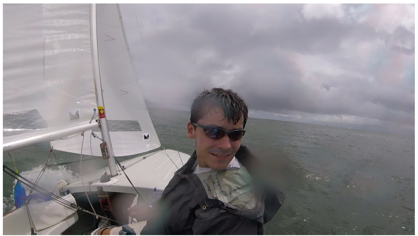
Day 1 Race 1 – After the start. Still raining. How we doing on the fleet?

In the second race, we had a good start, sailed well, and finished 4<sup>th</sup>, narrowly missing third place. At the end of the first day, we were in 8<sup>th</sup> place overall. Our only casualty of the weekend was a bent tiller extension that happened somewhere in the midst of an encounter with a boat from the Hampton fleet that we'd caught up with on Saturday. They got in our way and when we got clear of them, I looked back and the tiller extension looked like a noodle.