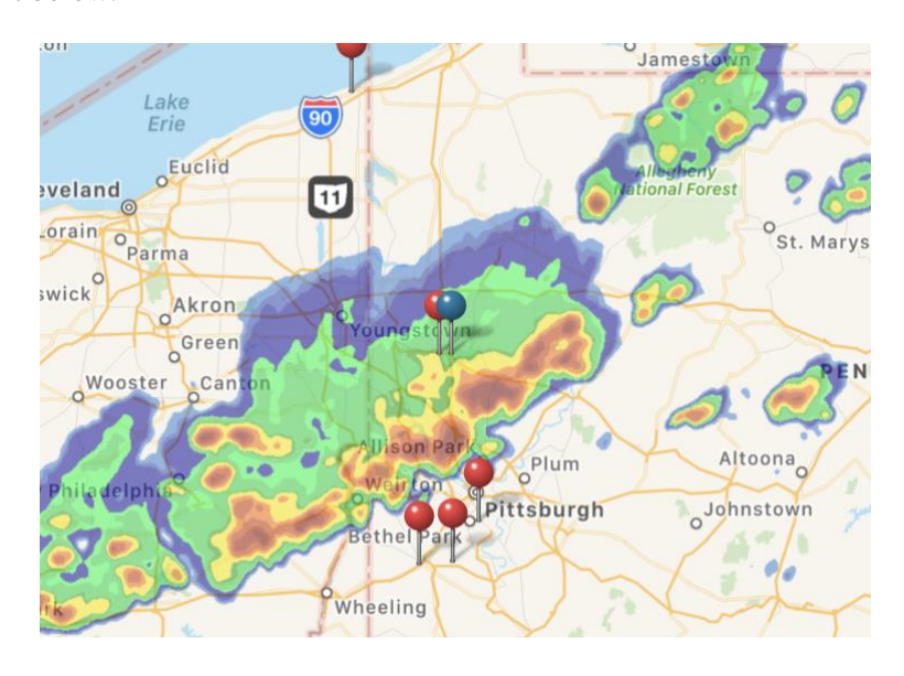
Storm Front from WeatherBug App

The cumulonimbus cloud is on the far left with cumulo congestus clouds in the middle and right. Generally, in western Pennsylvania the cumulus congestus clouds take greater than 30 minutes to develop into cumulonimbus thunder storm clouds. This 30 minutes gives you time to dock the boat, and monitor the conditions for getting better or worse. Some thunderstorms develop from storm fronts and are easier to forecast. Other storms, such as afternoon summer storms in July, develop independently of storm fronts and are harder to forecast in time and place. The radar screen capture from the WeatherBug App shows a storm front below.