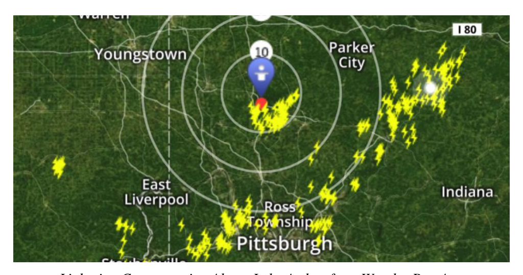
Lightning Concentration Above Lake Arthur from WeatherBug App

In addition to weather radar, WeatherBug comes with a lightning detection application. The red dot in the picture below is Watts Bay on the North Shore of Lake Arthur.