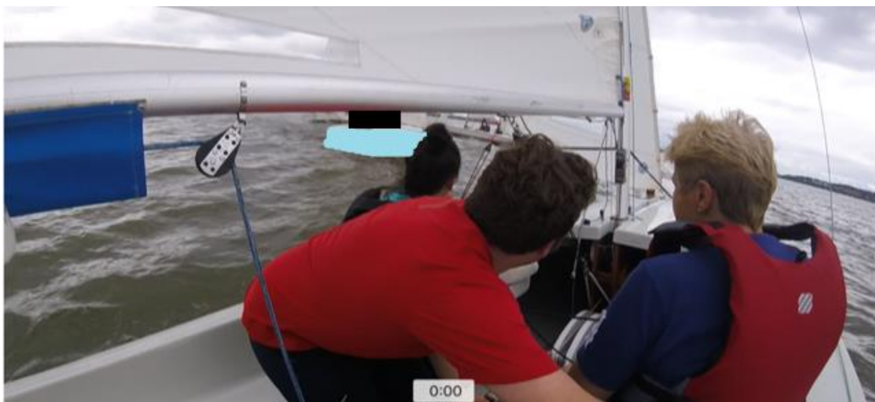
On starboard tack fetching the mark, but blue boat barrels in on port inside the zone and is convinced they are entitled to room.

Wednesday nights provide a great laboratory for exploring the racing rules of sailing in a benign environment and an opportunity to illustrate scenarios with photos using a GoPro. In the photos below, the identities of a boat and crew are obscured to protect the dignity of the offenders.