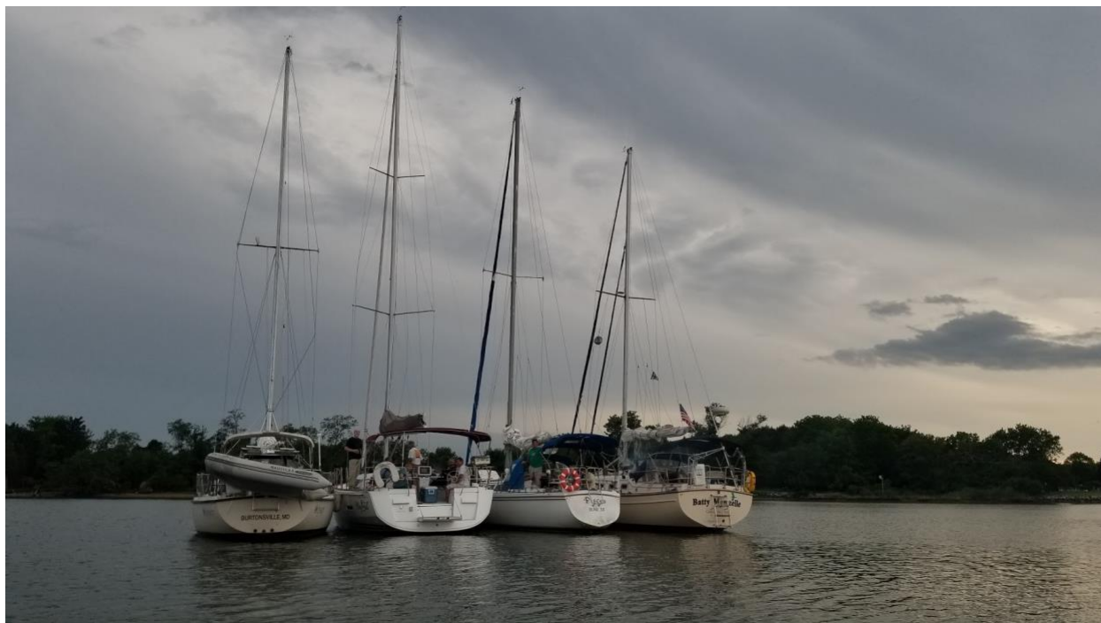
4 boats out of 5 during our Memorial Day flotilla on the Chesapeake Bay