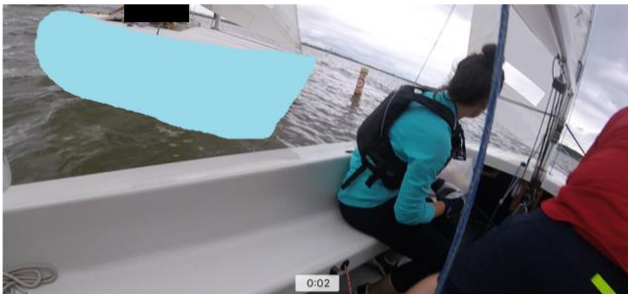
There's the mark. I'm the right of way boat, but time for me to maneuver to avoid collision. That's a foul.