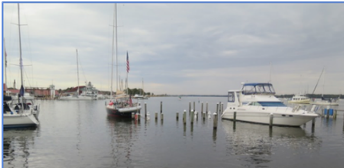
ST. MICHAEL'S MARINA IN OCTOBER

Remember to be courteous of other boaters looking for their slips – some of these marinas, like in St Michaels and Annapolis usually have many boats coming in to dock at the same time, especially on Friday and Saturday nights in the summer – be patient, as you have already made your reservations on the app – you have a guaranteed home for the evening. Snag-A-Slip is growing by leaps and bounds and usually has a booth at the Annapolis boat shows. We've seen them in Newport and Fort Lauderdale as well. They are also part of OASIS Marinas and part of the group that publishes Marina Life , a great magazine to gain insights into some of the best places to visit along the east coast. Time to shower and get a bite to eat. Enjoy your time on the water – life is good.