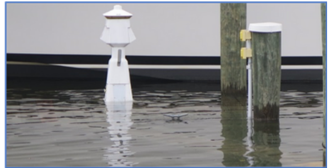
DOCK AND SLIP NUMBERS WERE UNDER WATER