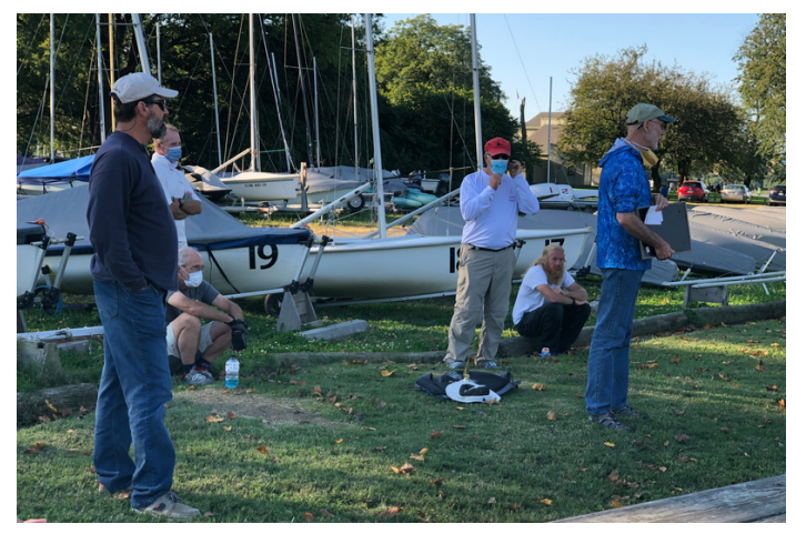
FSSA AWARD PRESENTATION AT WASHINGTON SAILING MARINA AND AT A SAFE DISTANCE