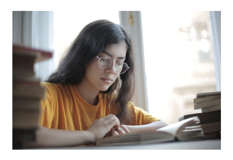
Test your knowledge. Answers on page 6.

No, this isn't the sequel to Snakes on A Plane. It's a quiz. When you buy "rope" at the chandlery, it magically turns into something else when brought aboard a boat. If it is being used to raise sails, it's a "halyard." If it is controlling sails, it is a "sheet." If it ties you to the dock, it is a "line." But, at least six ropes might be found on sailboats. Can you name them?