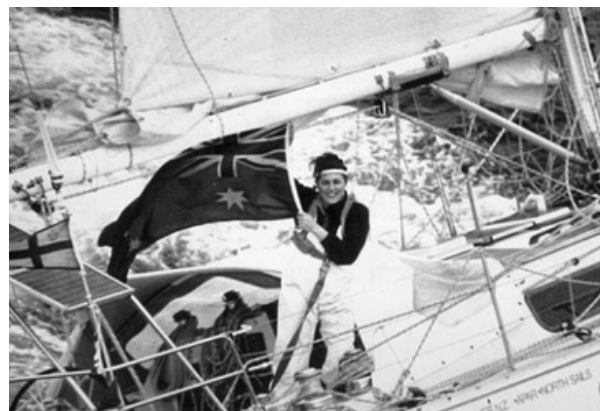
DAME ELLEN MACARTHUR

In honor and celebration of Women's History Month , here's a great post from Yachting & Boating World about some of the top female trailblazers in the world -- from Krystyna Chojnowska-Liskiewicz , the first woman to circumnavigate the globe to Laura Dekker , the youngest female to do the same.