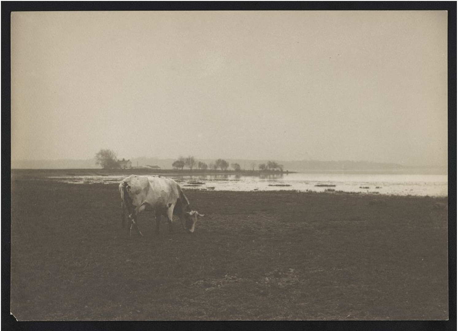
Jones Point Light circa 1895

Holy Guacamole Swiss Cheese 20% Guacamole 79% Onion 1% Red Foxx