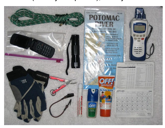
Jan's Bag Check #2

I also frequently carry a water-repellent windbreaker for protection from sun or rain, an extra bottle of water for that forgetful crewman, a personal PFD with a personal whistle attached, and a cotton bandana. (continued on page 6)