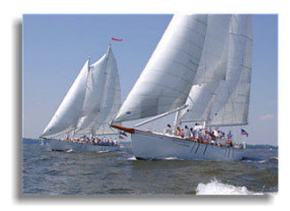
Come Sail Away General Membership Meeting, March 8th Happy Hour: 6:30pm – 7:30pm (Cheap beer & burgers!) Special Meeting – vote on dues increase: 7:30-7:40pm Business Meeting and Speaker: 7:40pm – 9:00pm

At the Old Town Alexandria American Legion, 400 Cameron Street, Alexandria, Va.