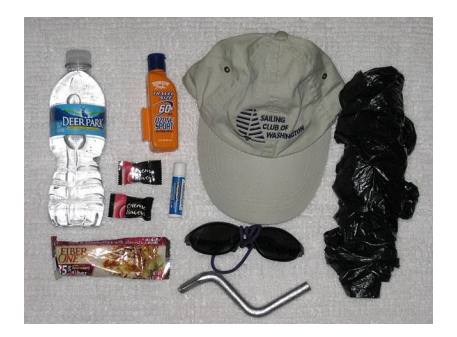
Jan's Bag Check #1

I recommend also carrying a power bar or hard candies, a large rolled up plastic garbage bag to use as an emergency rain pullover or protection from wind chill, a Flying Scot winch handle (even if you aren't a Scot skipper), high-SPF Chapstick to protect your lips, and a plastic zip-lock bag for your wallet,