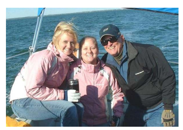
Bay Sailing – New Years Day

Winds 25 to 30 kts, gale warning up. New Years Day Seaford Yacht Club Race with four boats. I crewed on a 25 foot Freedom. Attached are some of the pix before it really started to blow in the afternoon. On leg 4 of six we busted the car and had to sail with the sheet lashed between the blocks.