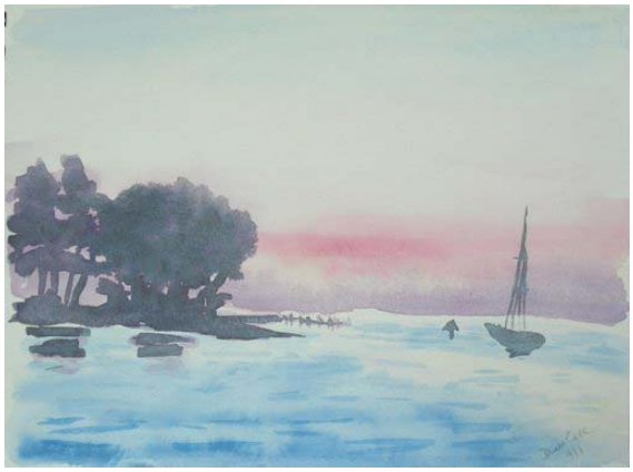
Dawn at Dunn Cove Watercolor by Lynne Russillo

Check out photos of scenic Chesapeake Bay watercolors painted by SCOW member Lynne Russillo as well as photos she took on the SCOW Labor Day raft-up.