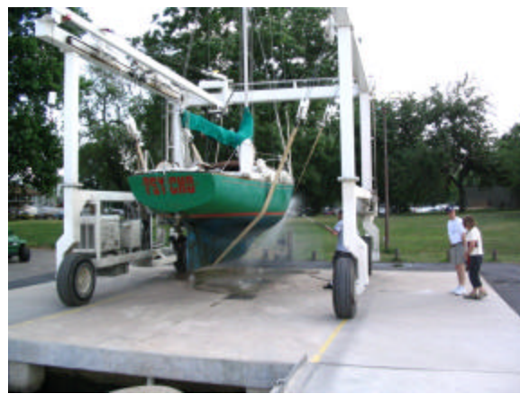
Psycho Gets a Spray Wash