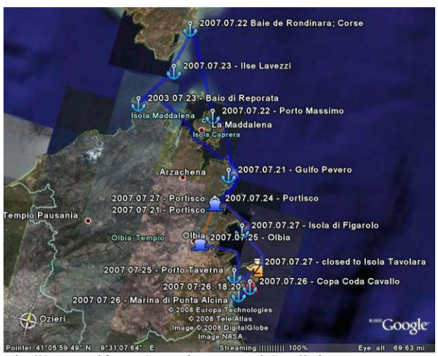
Pic #3 – Wolfgang's cruise around Sardinia