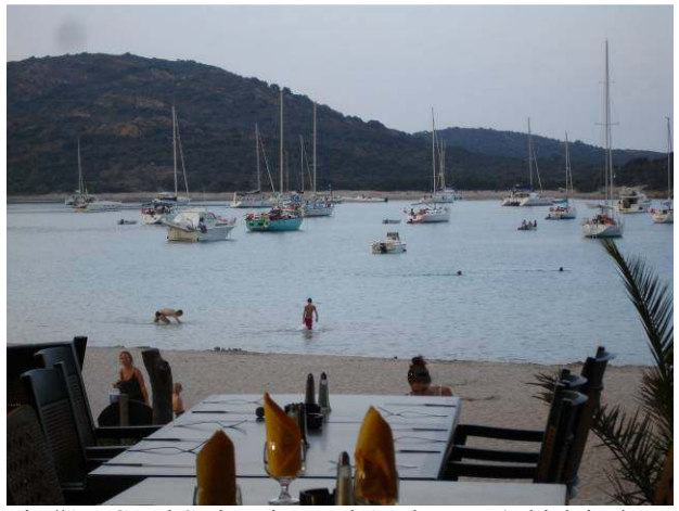
Pic #1 – Good Swimming and Anchorage (which is the key criteria for selecting cruising destinations) at the Baie de Rondinara