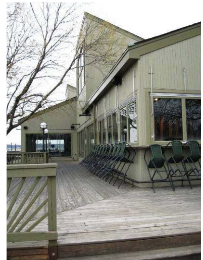
Hungry (and thirsty) SCOW sailors anticipate the re-opening of the waterfront restaurant March 17th.