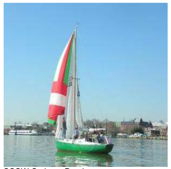
SCOW Cruiser - Psycho

Psycho has been owned for years by The Sailing Club of Washington (<a href="www.scow.org">www.scow.org</a>). The boat was designed to meet the Midget Ocean Racing Cruiser criteria and as such sails very well on the river with a storm jib and reefed main and full keel. When other boats are more comfortable staying at the dock – Psycho is more comfortable in a strong breeze. There are 7 Dolphins around Washington and the Chesapeake area - Bonnie Lassie, Cove Dweller, Mo-Dean, Pippin, Psycho, Rae Lee and Timesweep. They are listed alphabetically