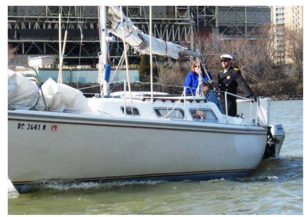
SCOW Commodore – Enjoying the Spring Weather