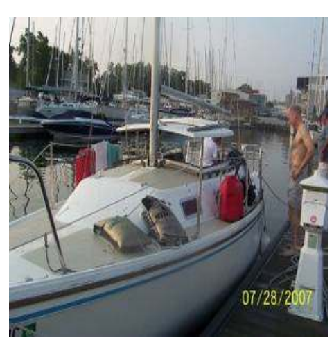
SCOW Cruiser - Topaz

Topaz (Lucky yellow Gemstone) was purchase in 2007 by The Sailing Club of Washington (www.scow.org). The Boat Asset committee had criteria which specifically recommended a boat with a large cockpit and cabin (which is good for classes), reasonable sail area, a swing keel (which is good for river sailing in thin water), and a well know manufacturer. The boat had one previous owner and was kept in the summer months in a fresh water lake in upstate New York. The freshwater and occasional water time ensured a sound bottom for a boat of this age. The boat was initially delivered to Annapolis for a complete survey and bottom work and then successfully delivered by Ron Sheldon, Steve Linke and Brigetta during a 3 day trip down the bay and up the Potomac River.