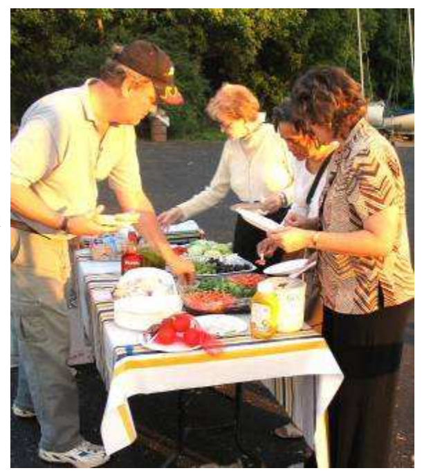
Thursday Social Sail