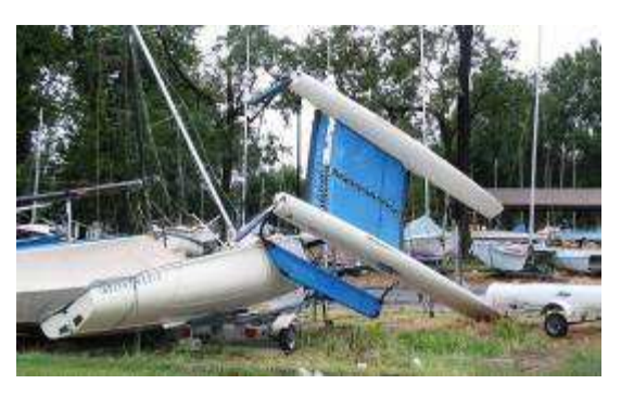
WSM - Upended Catamaran

http://pearsoncurrent.com/tpcarchive/tpc-1-1.htm