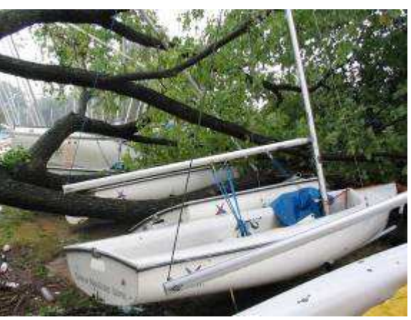
Georgetown FJ Hit by Tree