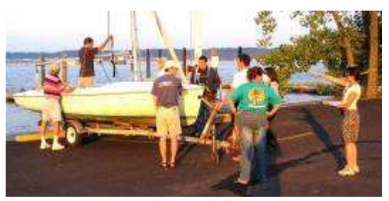
Launching a Flying Scot