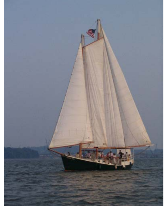
SCOW - Sailing on Marina Day On American Spirit

The coming Fall also reminds us that the Board member terms are coming to an end and we are beginning the process of selecting a new slate for 2006. We need nominations by the October general membership meeting so we can elect a Board in November. You could have another title for your resume if you get elected!!