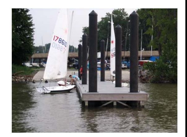
<u>SCOW Picnics</u> Laser Sailors at WSM boat ramp

The boats are reserved and will be assigned to the skipper and team that raise the largest amount of money for the Leukemia Society. Teams must have a racing-qualified cruiser skipper for the boat during the race. The skipper and team that raise the most donations will get first choice of boats for the Leukemia Cup. Fund raising can continue until Thursday, September 8. At the Social Sail on that date, we will announce the fund raising results and will allow the winning team to select their preferred boat. (Continued on pg 3)