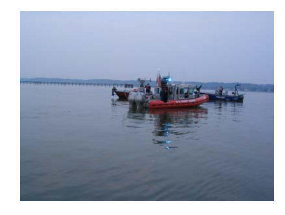
SCOW - Thursday Picnic Authorities ponder a rescue – waterski boat stuck on the sandbar!

Be sure to check out the website <u>www.scow.org</u> for a complete calendar of racing, sailing and social activities!