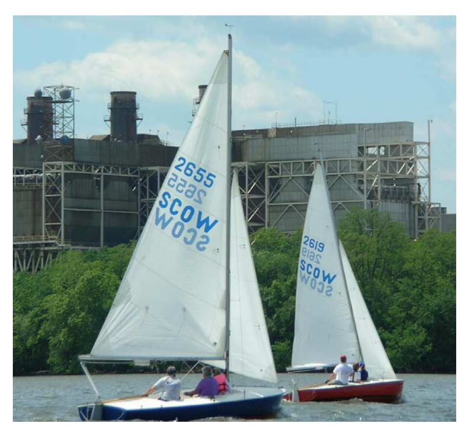
SCOW – Sunday Race (continued from previous page)