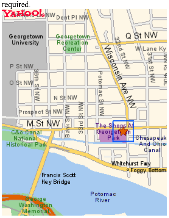
SCOW Hale and Farewell Location At City Tavern Club