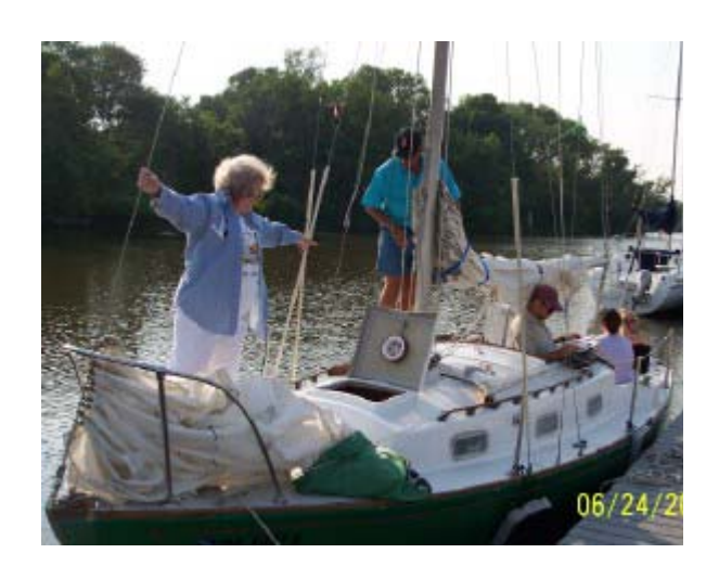
SCOW Psycho – Ready for a Cruise

Well, you're asking: What about that safe boating course I have to complete before I can be a SCOW skipper?