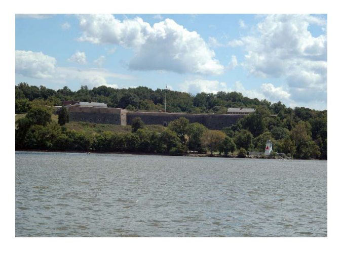
SCOW Ft Washington on the Potomac River

Do you know anyone named Gale? It has been a particularly tough year for us, with big storms, and we have become familiar with hurricane classifications. At the other end of the high wind scale is a Gale, a continuous strong wind, of about thirty five to sixty five knots in velocity. The derivation is uncertain; it could be from the Old Norse term "gallen," meaning mad, or frantic.