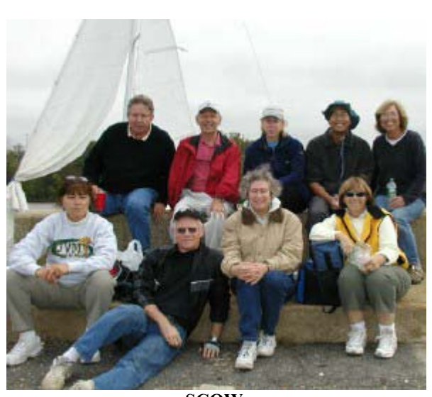
<u>SCOW</u> Columbus Day Sail

Be sure to check out the website <u>www.scow.org</u> for a complete calendar of racing, sailing and social activities!