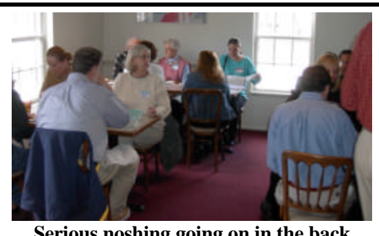
Serious noshing going on in the back room!