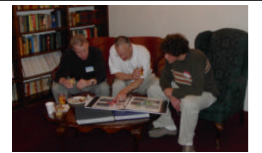
"Back in the day the boats were smaller, the waves were bigger and engines were on trains"