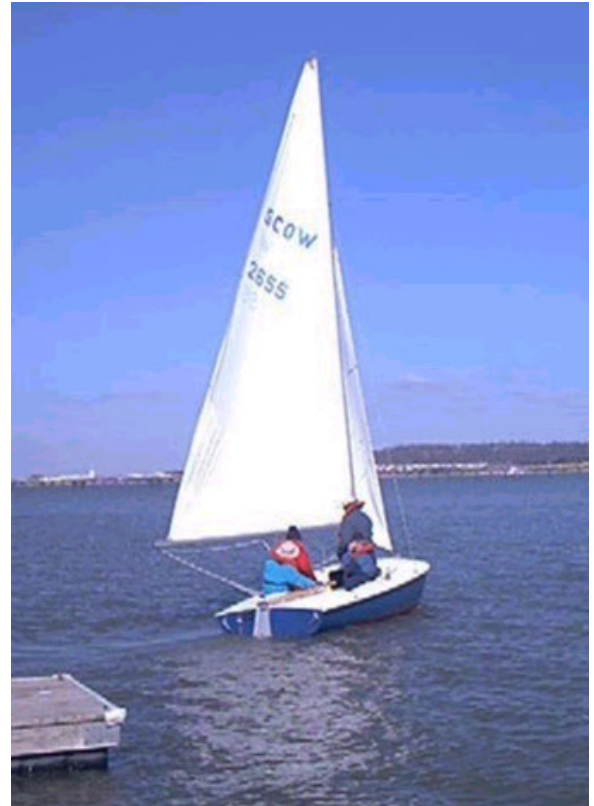
Photo courtesy of George Umberger Danschweida at the March 15th Checkout Day

To volunteer, call the hotline at 202-628-7245 (628-SAIL) and press 4 before the end of the message to go to the audition line. There is no prompt for 4 in the message that answers the call, but it will work. Since the quality of telephones varies a lot, please call from the telephone that you would use to update the messages.