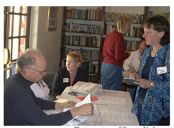
Directors Man Their Stations at the Re-Up Brunch

The bad news is that the work is behind schedule. We expect that, through the month of April and perhaps even into May, we will be looking for volunteers to help with a variety of jobs, including sanding and painting the deck. It also is possible that Psycho will be taken out of service for some time during those months. However, when the work is complete, Psycho will look as good as she sails and will be a popular club boat again.