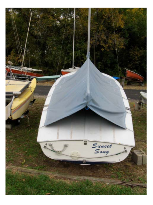
Sunset Song at rest in her WSM slip B-18

Thanks are extended to the Boat Asset Committee members and several key bosuns who conducted the fall inspections of all six fleet boats plus Sunset Song on October 24 in preparation for the upcoming Maintenance Day. If you can help with boat maintenance on November 7, please contact Tom Kelly.