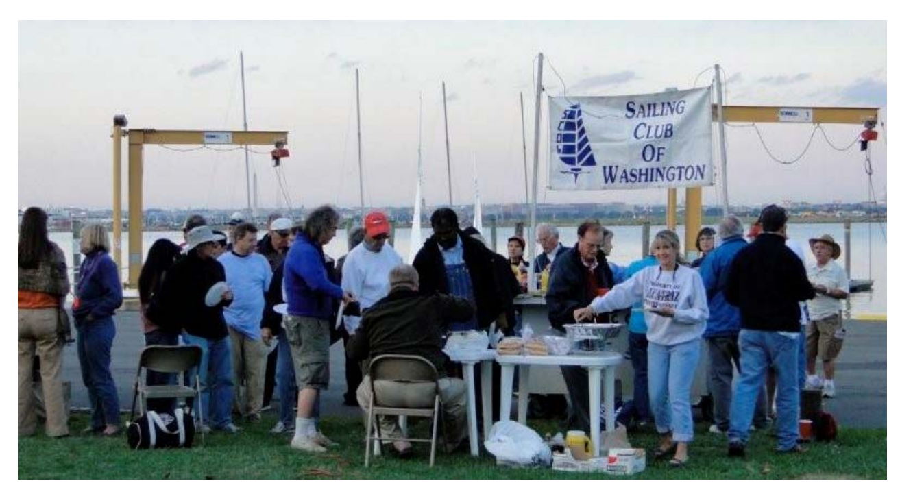
SCOW's annual Octoberfest -- featuring good food and great friends!