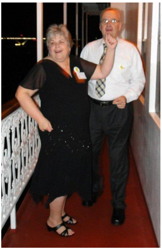
More Hail and Farewell Photos