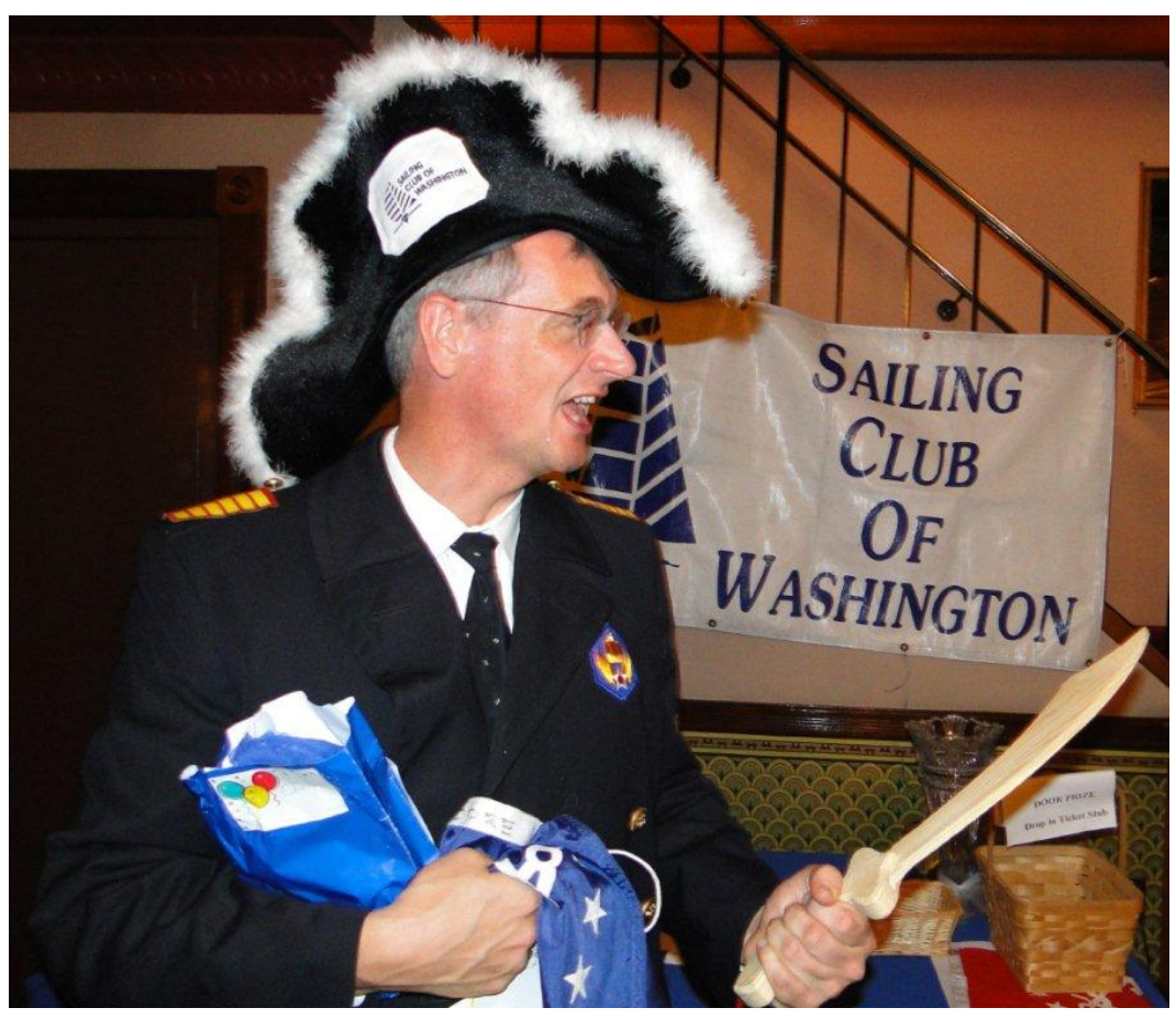
The 2010 Commodore prepares for the year ahead