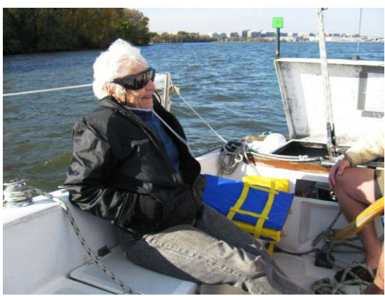
Enjoying a Fall Sail with SCOW