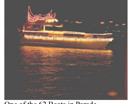
One of the 62 Boats in Parade

Please bring your NEW, unwrapped toy for children from toddlers to seventeen year olds (no guns, knives or weapons, please) to any of the parade functions. Or mail your tax deductible check to: Marine Toys for Tots Foundation, P.O. Box 1947, Quantico, Va 22134 Make check payable to: **Marine Toys for Tots Foundation**