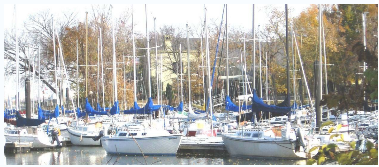
SCOW Cruisers - Topaz and Rebecca