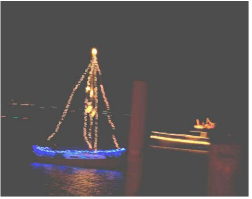
Liberty Belle – Skipper Dorothy Stocks