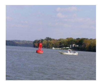
Ft Washington Marina